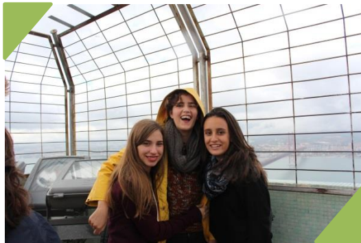
Three of us when we were on the top of the tower.

We were to reach us in Cristo Rey, we were crossing a very long bridge. In this sculpture we were climb to the top and we could see every city. In general we liked go to the Cristo Rey and we had a great time.