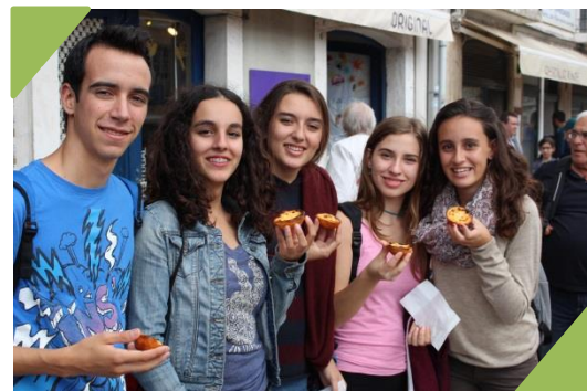
A part of our group before eating and tasting for the first time the famous "pastel de nata"

A part from "bacalhau", we had the chance of tasting delicious desserts as "serradura" (basically made with cookies, cream and condensed milk), another one that was extremely sweet ("baba de camelo") and also the famous "pastel de nata". We hope that we can come back to be fed as good as we were during that week!